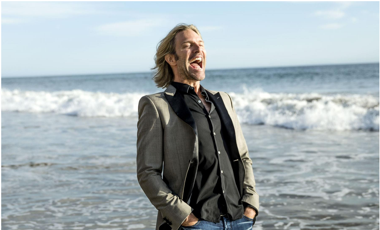
Big Sing California host, composer/conductor Eric Whitacre.

Free State-wide Singing Event Hosted by the Los Angeles Master Chorale & Composer/Conductor Eric Whitacre Saturday, July 21 st